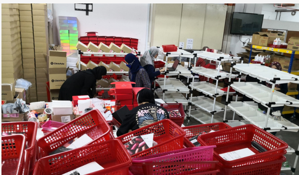
Ongoing inventory reorganization by ClickAsia employees.

PayRecon's automation solution , which includes a SMART POS system, PDA/SMART Scan App and more enhances warehouse efficiency by accurately tracking and managing inventory. With increased automation, warehouse productivity is optimized.