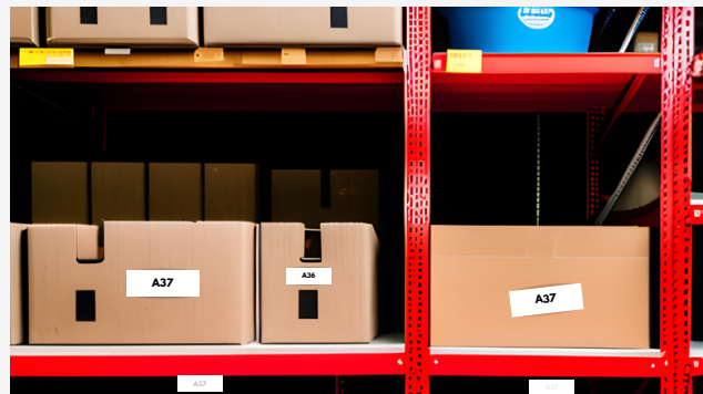
Difficult to read shelf label.