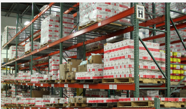
Good use of vertical space using shelves.

By implementing PayRecon's WMS (Warehouse Management System) , businesses can optimize their storage space preventing inefficient storage systems, reduce wasted space, and streamline warehouse operations.